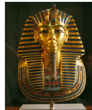
Tutankhamun - Pharaoh of Ancient Egypt